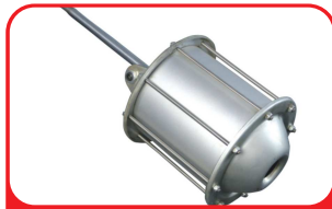
Optional single intake cylinder