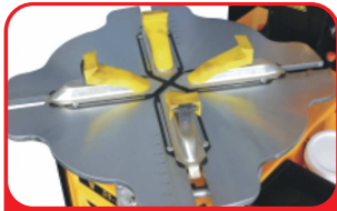
26" special designed working plate