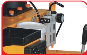
Oil-water separator for exporting